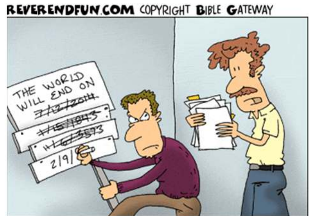
See Matthew 25:21 HOLD UP ... WE ALSO FORGOT TO CARRY A ONE ON PAGE THREE

message, his brethren went one step further and even tried to nullify what God had predicted. The same is our tendency today, especially in matters that we do not like. We prefer to distort and oppose God's message if it does not suit our biases, prejudices, and tastes. When the Sadducees approached Jesus with a seemingly difficult problem, Jesus replied in Matthew 22:29 "Ye do err, not knowing the scriptures, nor the power of God".